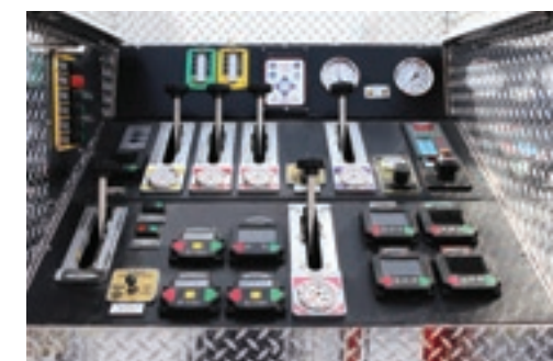
PUC top-mount pump panel