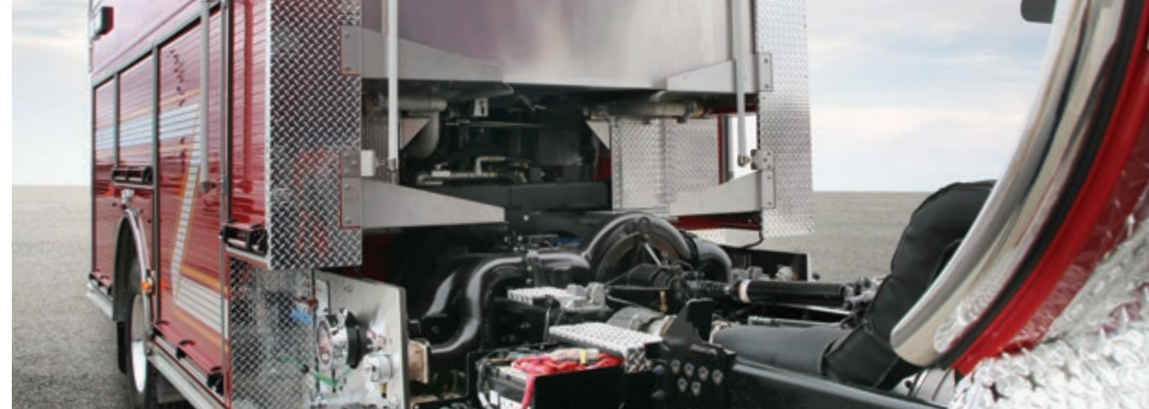
Easy access for service

All service points have been simplified with comprehensive pump and valve access, above frame pump service, automated service and maintenance messages, and direct support from a single-source manufacturer.