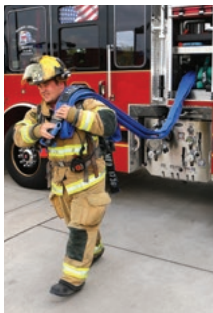
Lower crosslay height for easier hose removal