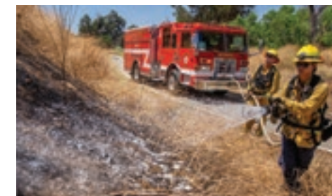
True pump and roll

The first modern tilt cab emergency response vehicle purpose-built for today's fire service.