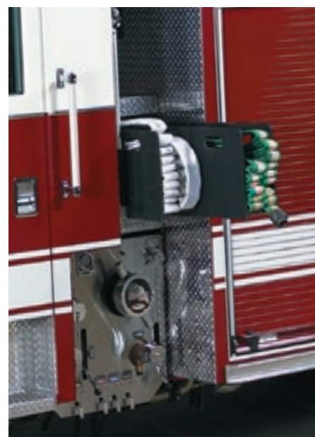
Chest height crosslays