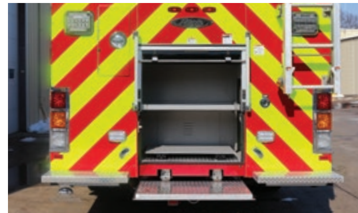
Space saver tailboard