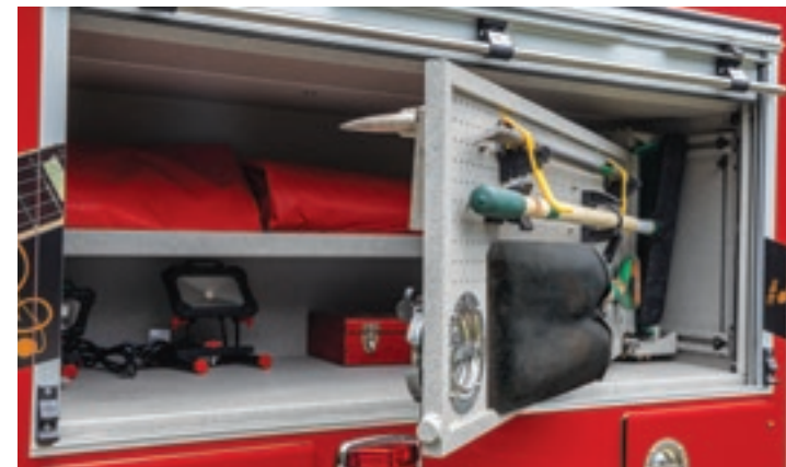
Swingout tool boards