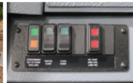
Single-touch water-foam CAFS selection