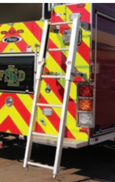
Angled folding ladder for a safer climb