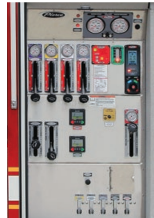
PUC side-mount pump panel