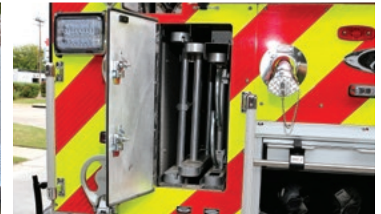
Chest height ladder storage