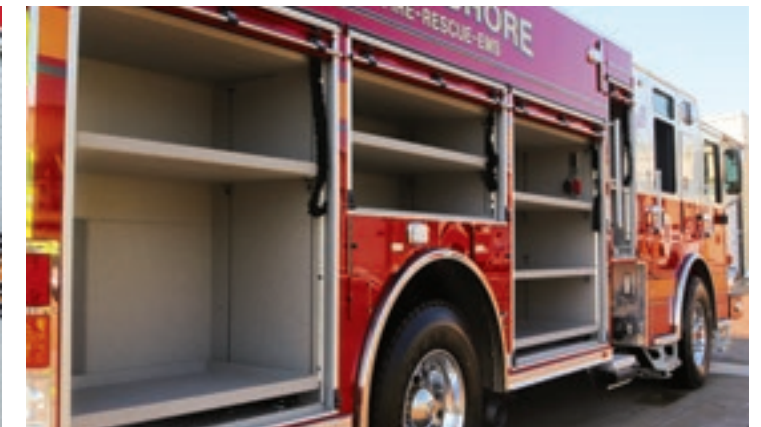
Clean compartment interior