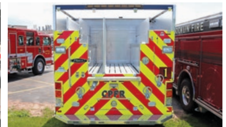
Low hose bed